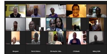
Grenada Zoom Class

For the Security of those we work with internationally, please be discreet in sharing the contents of this newsletter on social media