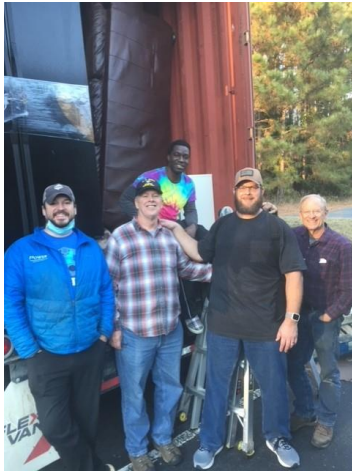
Loading the Container for Haiti

For the Security of those we work with internationally, please be discreet in sharing the contents of this newsletter on social media