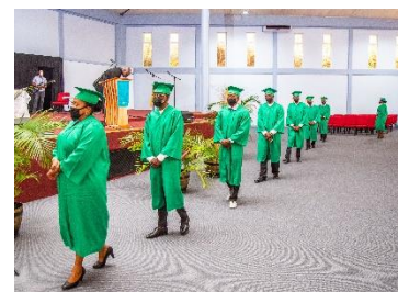
Graduation at Grenada Institute for Theological Education

For the Security of those we work with internationally, please be discreet in sharing the contents of this newsletter on social media